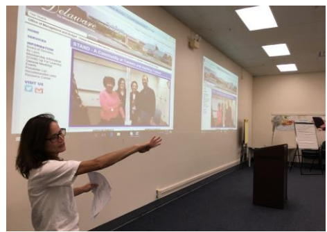
Our Dear President kicking off the meeting

T-shirts are available for $39.99 while supplies last.......... Just kidding!